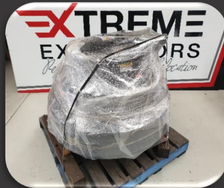
Hitachi EX2500/2600 Travel Reductions