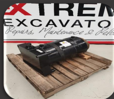
CAT/RH 6040/6060/170/340 Track Adiuster