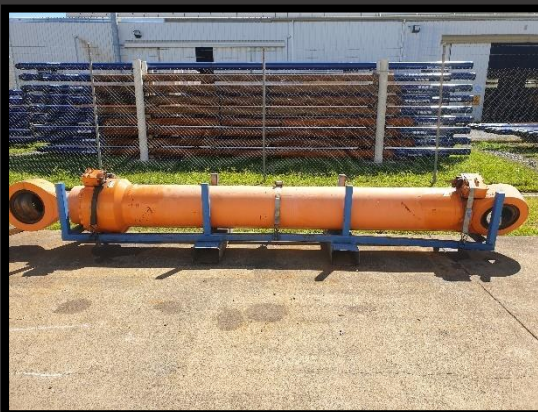
EX3600 Boom Cylinder