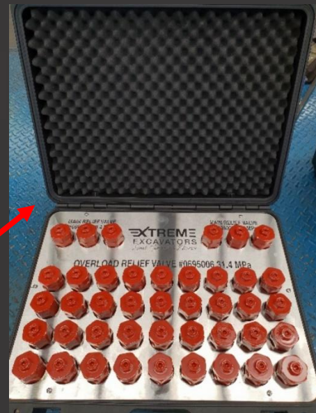
Hitachi EX5500/5600 Full Relief valve kit