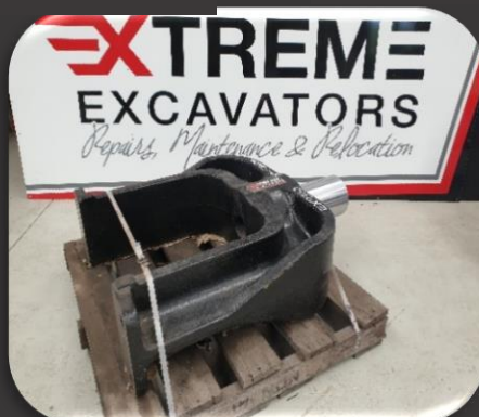
Hitachi EX2500/2600/3600 5500/5600 Idler Yokes