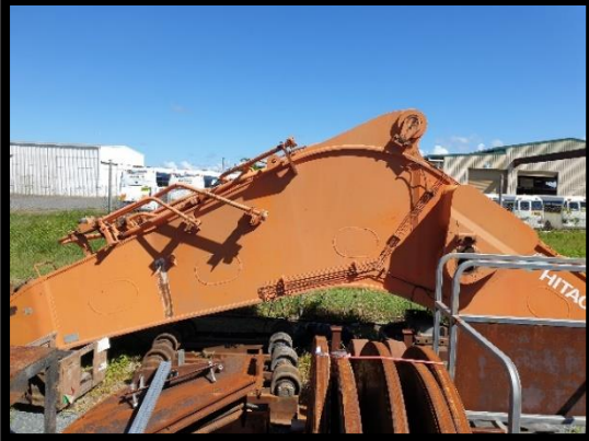
EX2500 Boom (Crack Report Available)