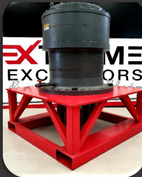
Hitachi EX2500/2600/3600-5 Swing Reductions