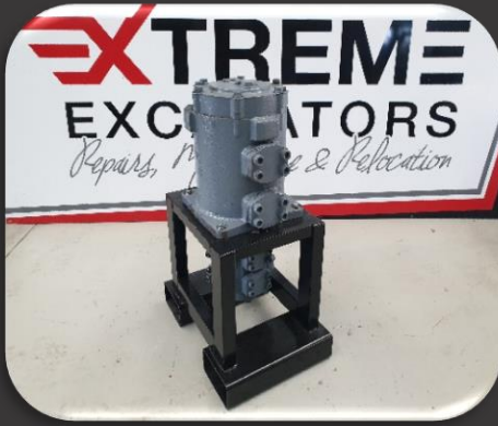
Hitachi EX2500/2600/3600 Centre Joints