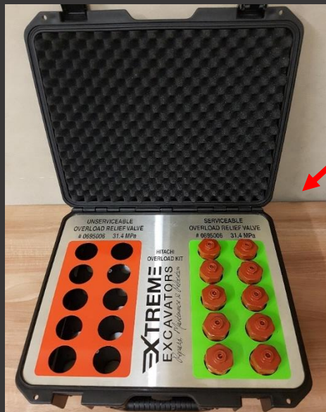
Hitachi Breakdown Kit