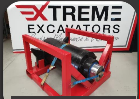
Hitachi EX2500/2600/3600/ 5500/5600 Track Adjusters