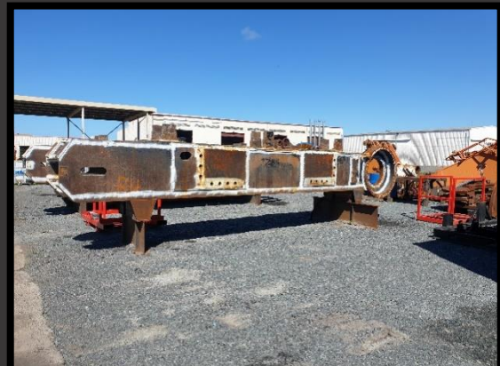
EX2500-5/6, EX2600 Track Frames