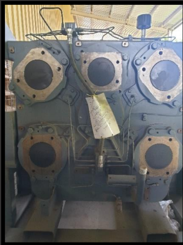
EX3600-5 PTO (Rebuilt)