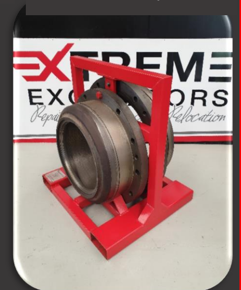
Hitachi EX2500/2600/3600/ 5500/5600 Bearing Cartridges